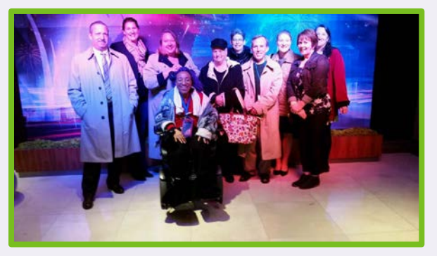
CAC members the AUCD Conference