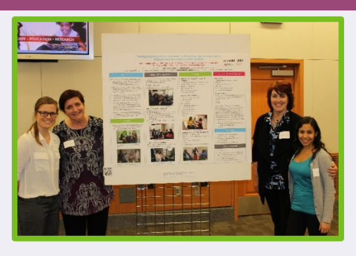
LEND trainees at poster presentation