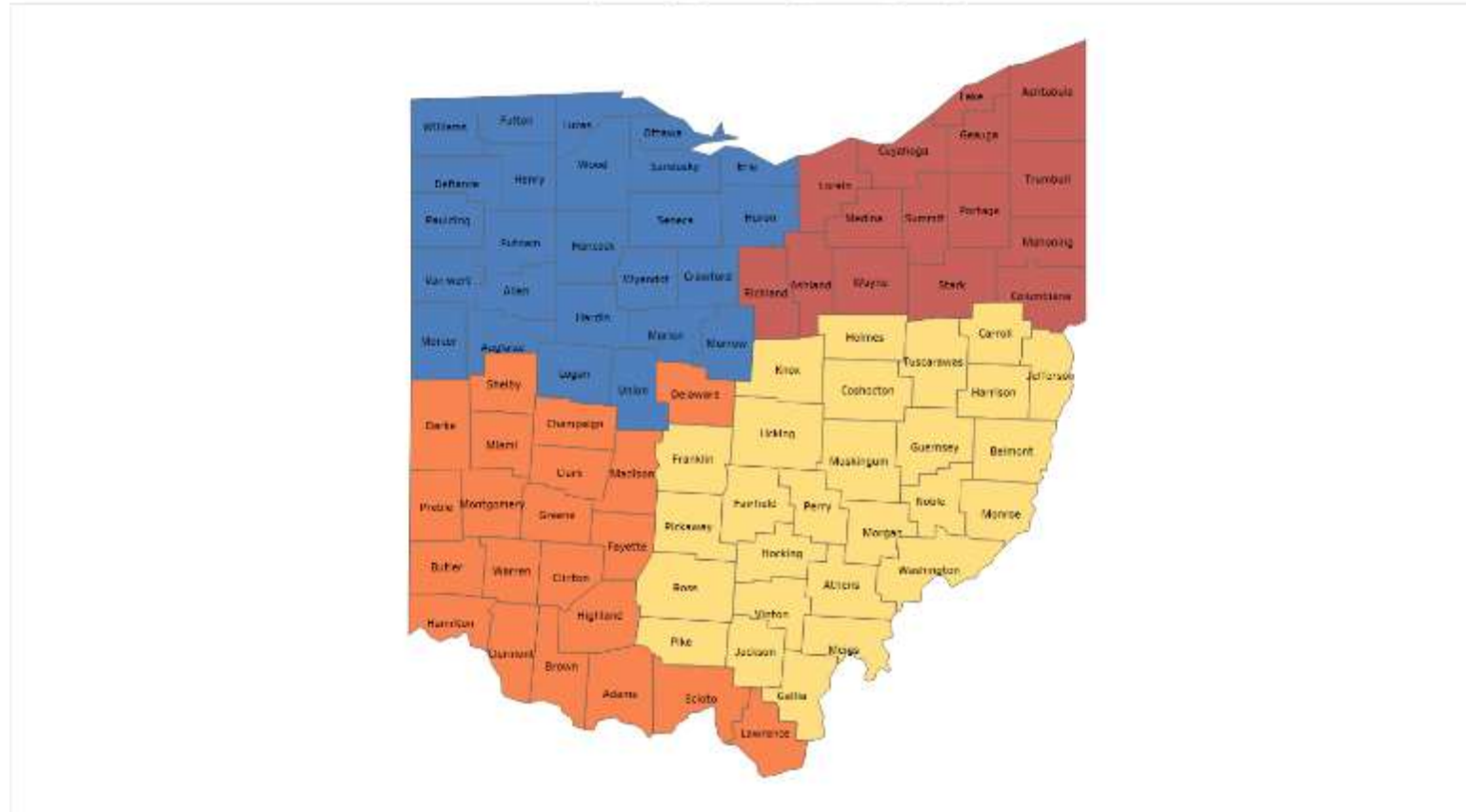
Community Life Engagement Project Manager Regions