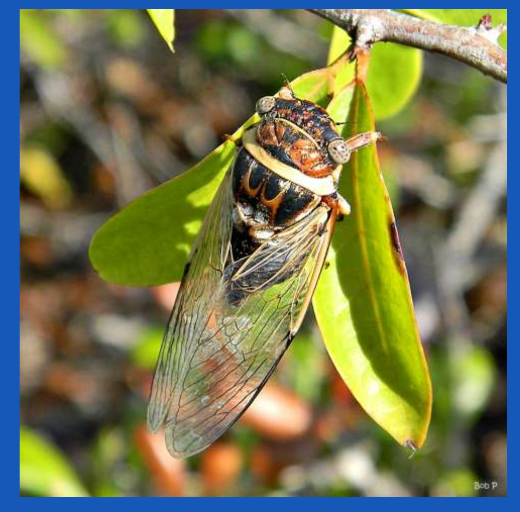
Click here to hear what they sound like